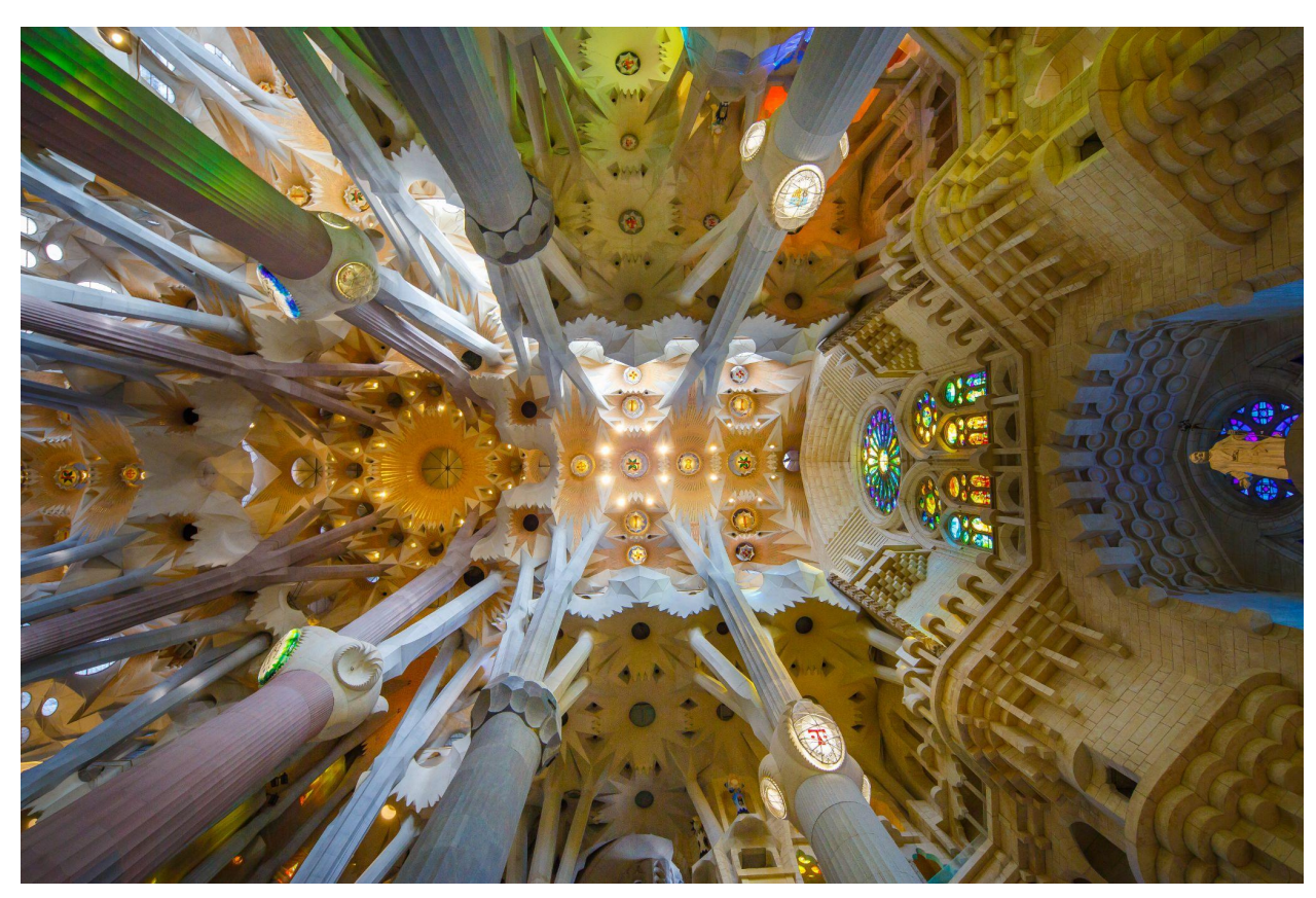
Sagrada Familia, Barcelona, Spain

When visual objects suggest there is a vast process around and beyond their visual form, you start to get a sense of infinity, vastness, mystery.— <u>Dacher Keltner</u>